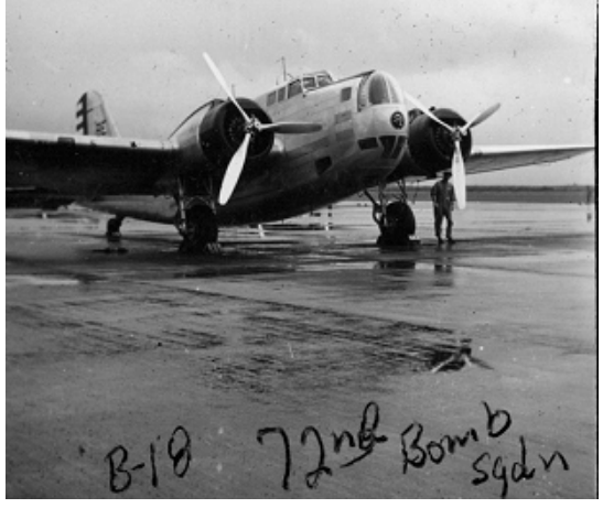
72 Bombardment Squadron B-18

DH-4 DH-4M NBS-1 LB-5 B-4 B-4A B-5 B-5A LB-6 B-12, 1936-1938